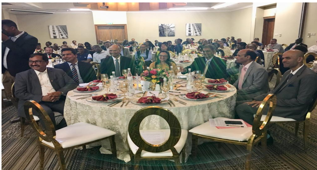
Attendees for the programme

India ITME Society, the apex non-profit industry body from India organized “ India Business Networking Programme ” at Botswana in collaboration with Botswana Textile & Clothing Association & Botswana Trade & Investment Centre, coinciding with Botswana Global Expo 2019.